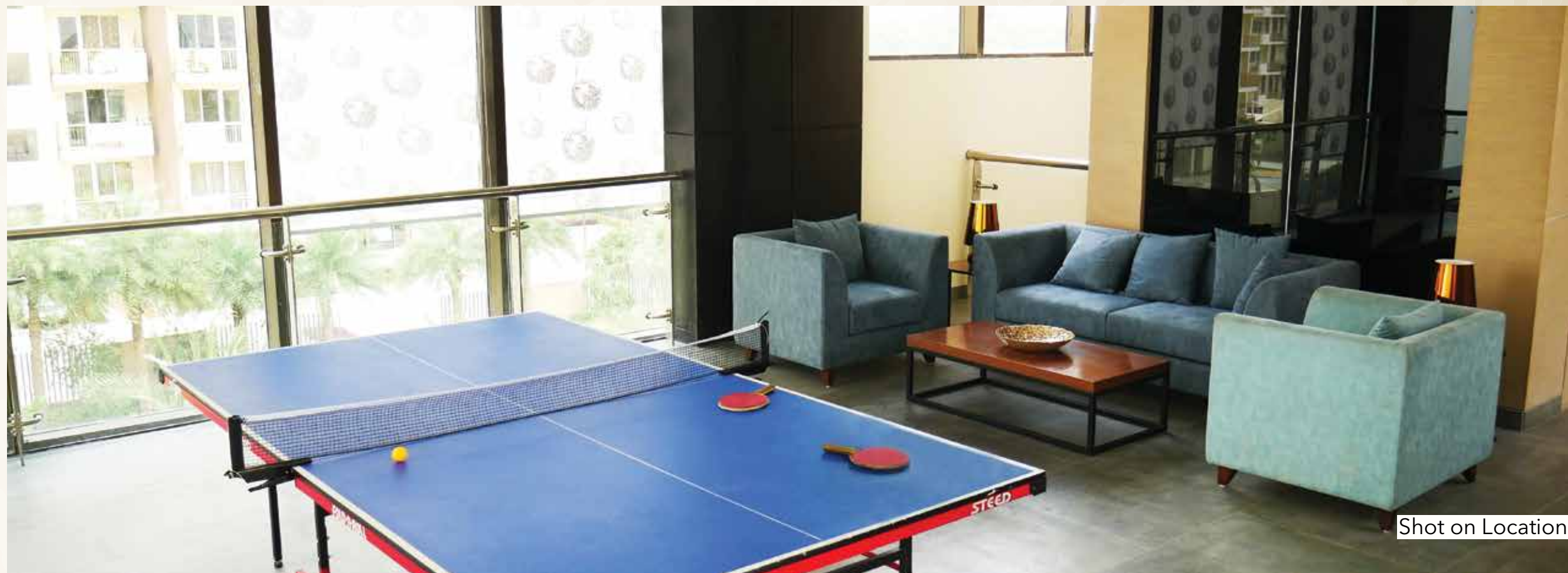
Shot on Location