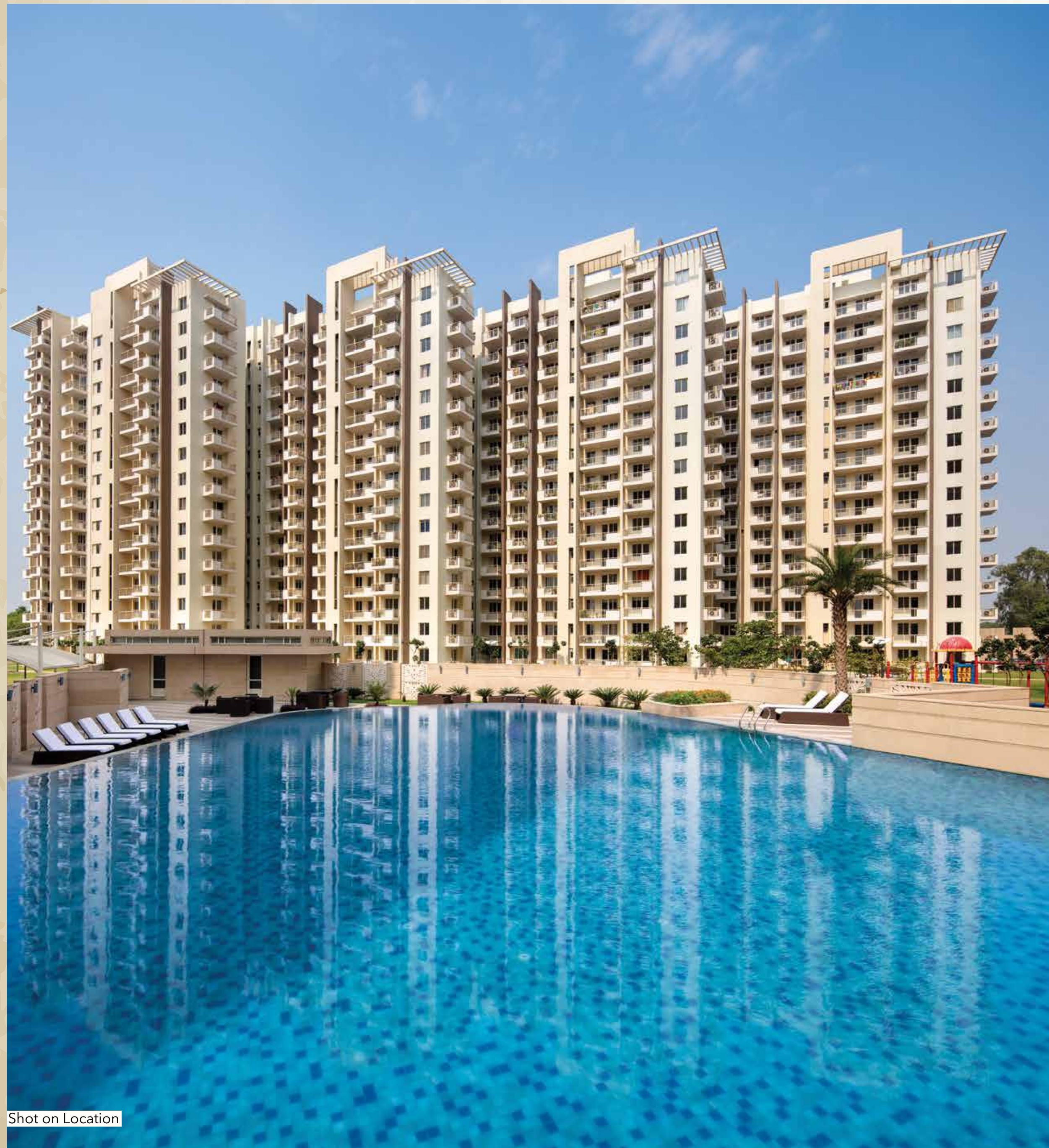
Shot on Location