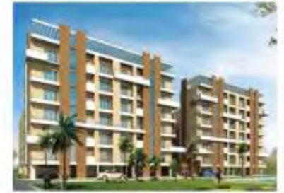
INDIABULLS central park MADURAI