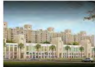
INDIABULLS river side AHMEDABAD