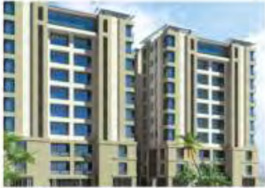
INDIABULLS central park VADODARA