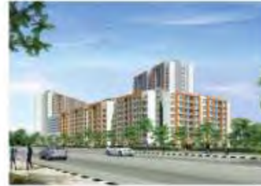
INDIABULLS central park INDORE