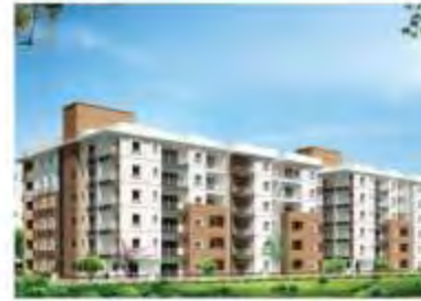
INDIABULLS central park HYDERABAD