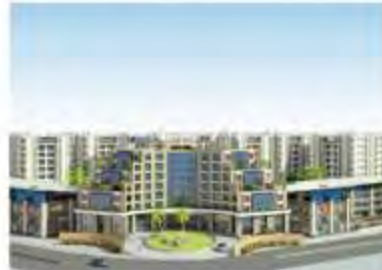
INDIABULLS MEGA MALL VADODARA