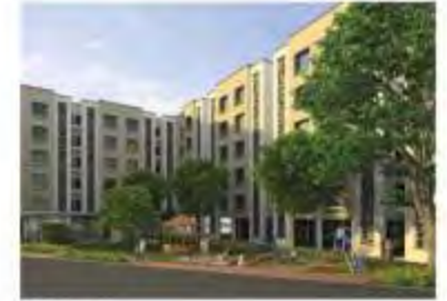
INDIABULLS vatika AHMEDABAD