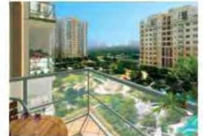
INDIABULLS CENTRUM PARK GURGAON